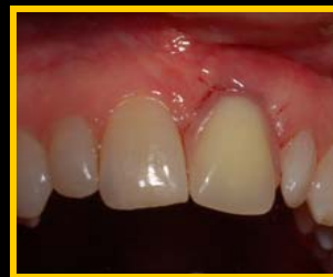
Partial denture in place